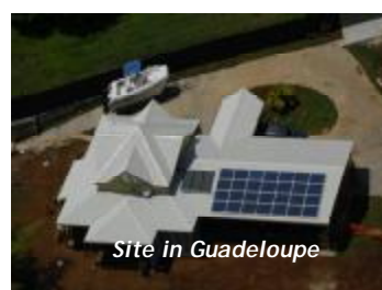
Site in Guadeloupe

The European battery industry is ready to talk to European and international agencies, institutions and governments in order to stimulate