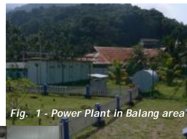
Fig. 1 - Power Plant in Balang area

About thirty remote hybrid generation power plants (photovoltaic energy and generation set) have been deployed in Malaysia since 2007. The plants are located in three areas of Malaysia: the Sabah area, Palau Tinggi Island and the Peroh-Tanah Amang area.